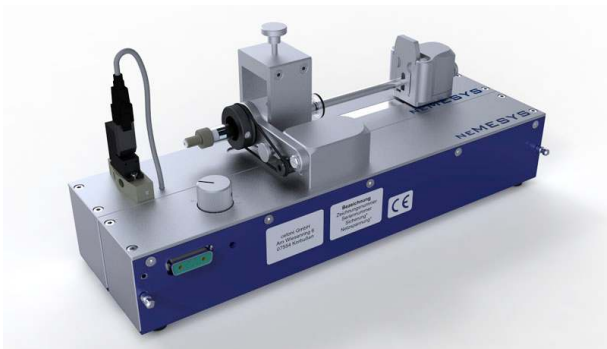
neMIX Syringe Stirrer with actuation module connected to neMESYS Dosing Module